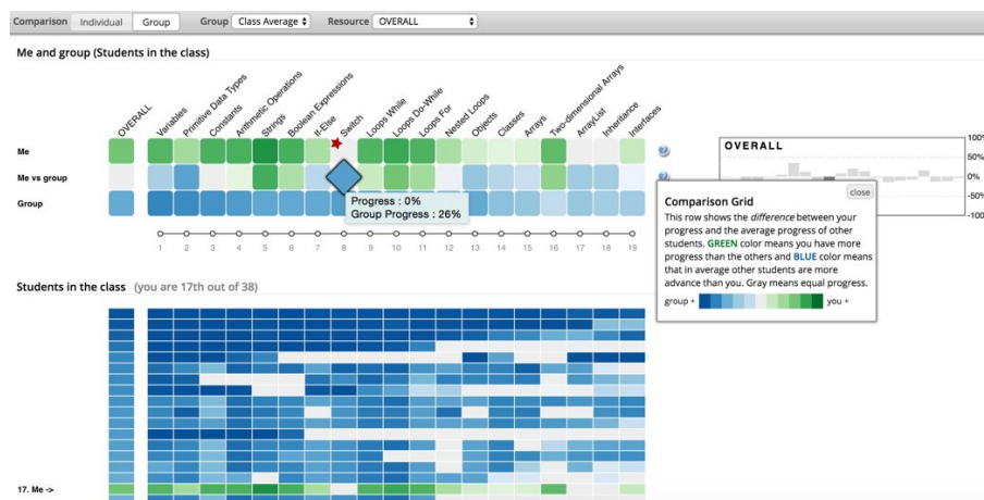
Figure 1: Mastery Grids' knowledge and progress visualization of Me, Me vs Group, Group, other learners embedding open learner model of oneself and social comparisons of a student with the group or other learners.